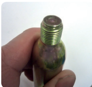
An unpierced cylinder

Repack and ensure manual inflation toggle is accessible and unlikely to be caught when being worn. If a yoke styled jacket, do not repack on existing fold lines as this may weaken material. Ensure all whistle strings and accessories are free of the velcro tape on inflation pocket or sides of yokes and ensure all straps are free of bladder. With vest jackets, ensure bladder has not moved from outer skin.