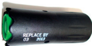
Check the expiry date on the auto-inflation cartridge

While you are reading this flyer why don't you put a reminder in your mobile phone, computer or calendar to get your inflatable serviced.