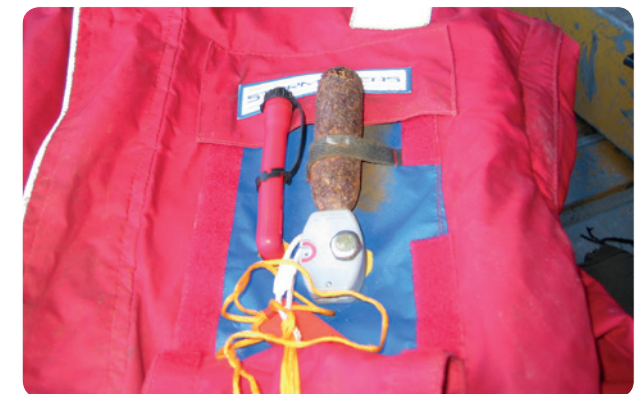
A poorly maintained PFD will reduce your chance of survival

Once activated, the CO 2 cylinder when pierced cannot be used again. It is the same if an auto jacket is used – a new cartridge will be required. Cylinders and cartridges are available at dealers and it is wise to have spares on the boat or at the shack just in case.