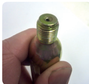
A pierced cylinder