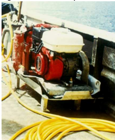
Figure 1 Hookah Pump

Many owners and divers using Hookah are not aware of the risks they are exposing themselves to. The hookah apparatus is a type of surface supply breathing apparatus (SSBA). The majority operating in Tasmania consist of an internal combustion petrol engine driving a low pressure air pump that supplies air to the divers.