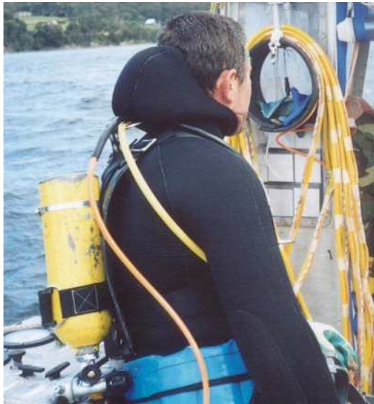
Figure 2 Accessory Air Supply

Entanglement falls under the same heading as failure of air supply. Tasmania has heaps of kelp and irregular reefs that can tangle the hookah hose. This may prevent return to the boat or ascent. An accessory air source allows disconnection from the hookah hose, and again a safe, slow swim to the surface