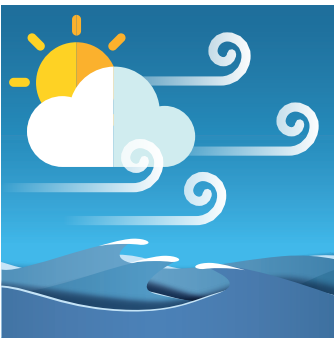
Strong winds and moderate waves