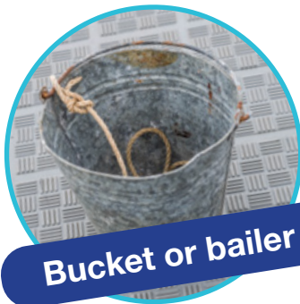
Bucket or bailer

This should stop your boat from drifting away.