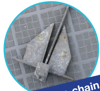
Anchor, chain and rope

This should stop your boat from drifting away.