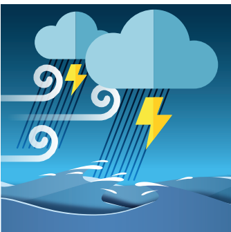
Stormy and very windy