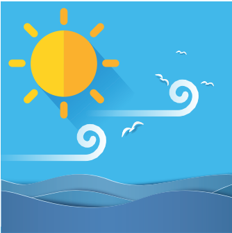
Light wind and small waves