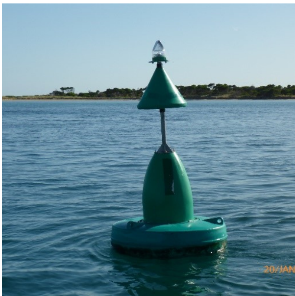
New light fitted on entrance buoy, Smithton

Recent works have included scheduled maintenance to the AtoN in the Duck River at Smithton. This resulted in several buoys being upgraded with the installation of top marks. An additional AtoN was also installed in the area to assist with safe navigation on the river.