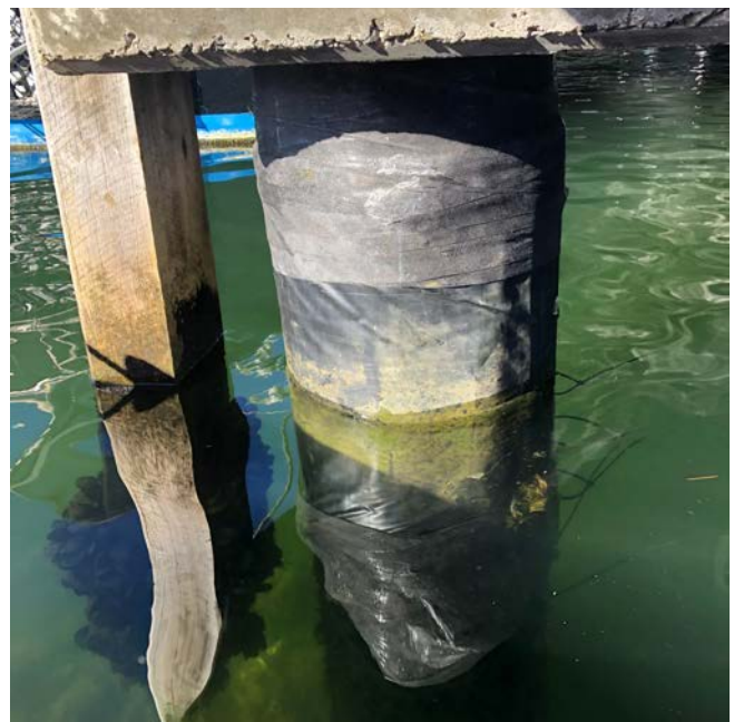
Jetty pile wrapping

MAST has completed Stage 2 of pile wrapping to the timber piles at Dunalley Jetty. This work has been undertaken to extend the life of the facility.