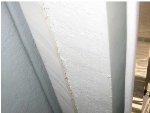
A significant amount of buoyancy can be fitted under the gunwale. Here, a 100mm and 50mm sheet have been installed side by side under compression. The buoyancy is also supported by a frame/rod holder, which is just out of view. No adhesive was required.