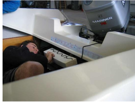
Foam being fitted under the outboard well with Sikaflex