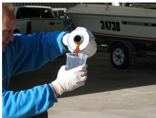
A 50/50 mix is measured and poured

Make sure that you use protective eyewear and gloves when handling this product.