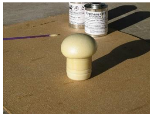
Polyurethane pouring (expanding) foam

Polyurethane sheet foam can wear away with abrasion, so it must be wrapped in plastic before fitting. Polyurethane is also available as liquid pouring foam.