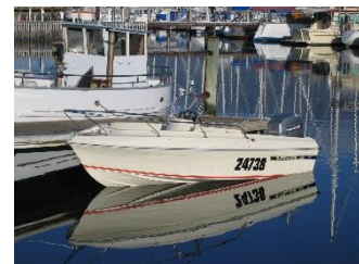
Above: The fibreglass runabouts that were part of the MAST trial to add buoyancy

Foam buoyancy can be cut, shaped and installed very easily using traditional wood-working techniques. The sheet foam can be marked with a felt-tipped pen and can be easily cut with a panel saw. A jigsaw is more useful for sheet thicknesses of 50mm and less.