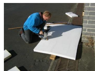
A jigsaw is more effective on thinner sheets