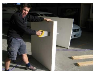
Foam is easily cut with a panel saw