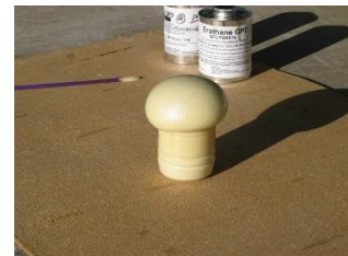
A small amount of liquid expands significantly