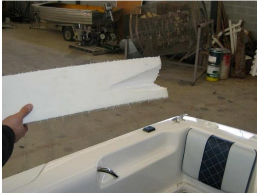
A 100mm thick piece of Microlen™ polyethylene foam about to be installed. Note the void that has been cut out to fit around the steering. This was shaped with a hacksaw blade.

You could also place a loose-fitting conduit over your controls before installing your foam so that controls can be “moused” through the conduit in the future.