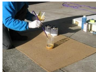
The liquid is mixed together thoroughly