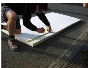
Foam is easily marked with a felt-tipped pen

Foam buoyancy can be cut, shaped and installed very easily using traditional wood-working techniques. The sheet foam can be marked with a felt-tipped pen and can be easily cut with a panel saw. A jigsaw is more useful for sheet thicknesses of 50mm and less.