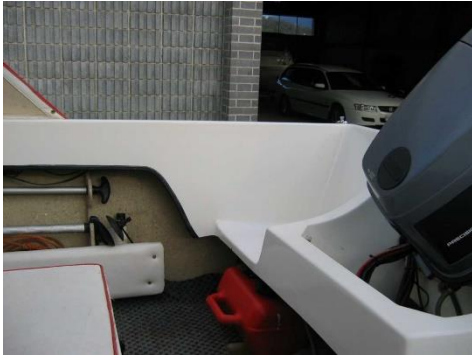
Foam can be fitted under the outboard well and deck mould