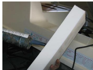
Microfen polyethylene foam