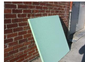
Polyurethane sheet foam